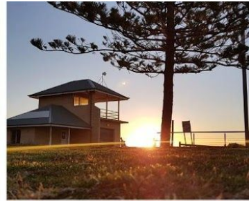
Another Swanny sunset