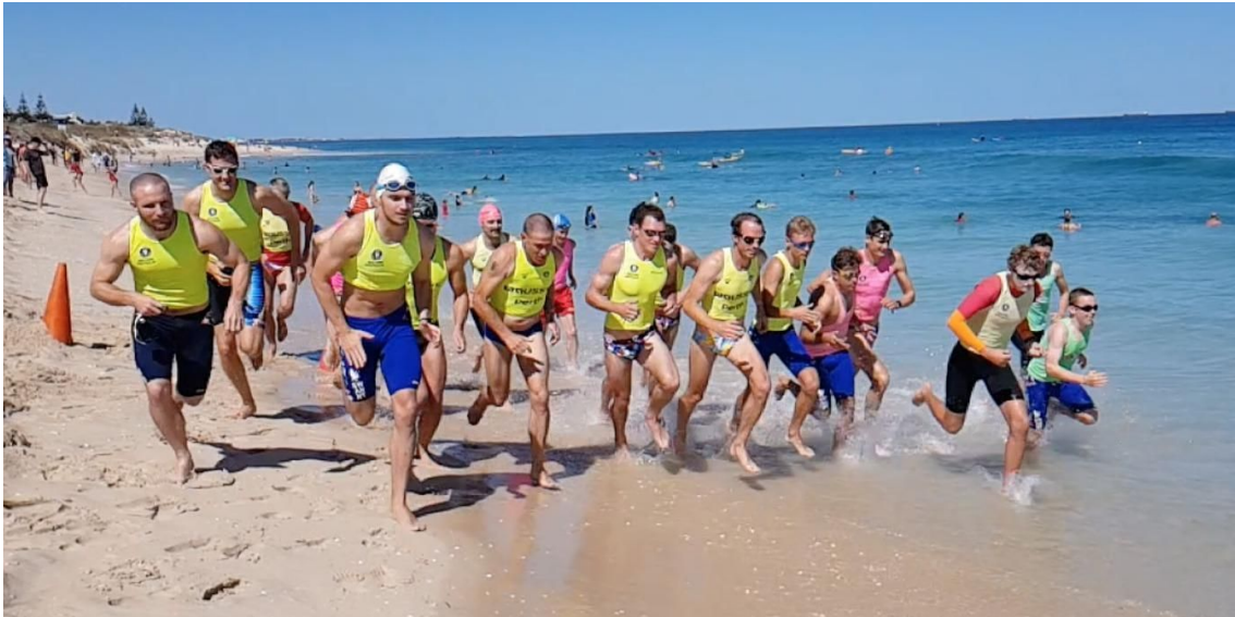
Start of the Male Run Swim Run at Club Championships