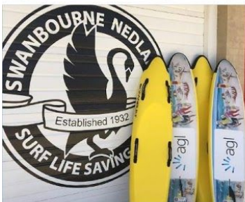
New nipper boards from AGL