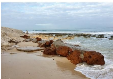
Swanny reef looking South. April 2019.