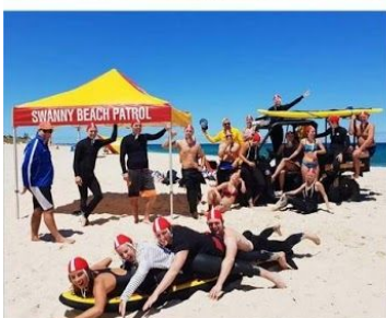
A new batch of Bronzies