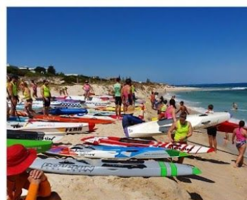
Club Champs chaos!