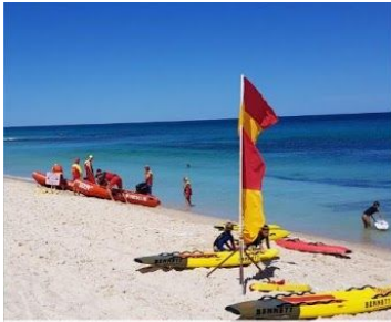
A typical day on patrol