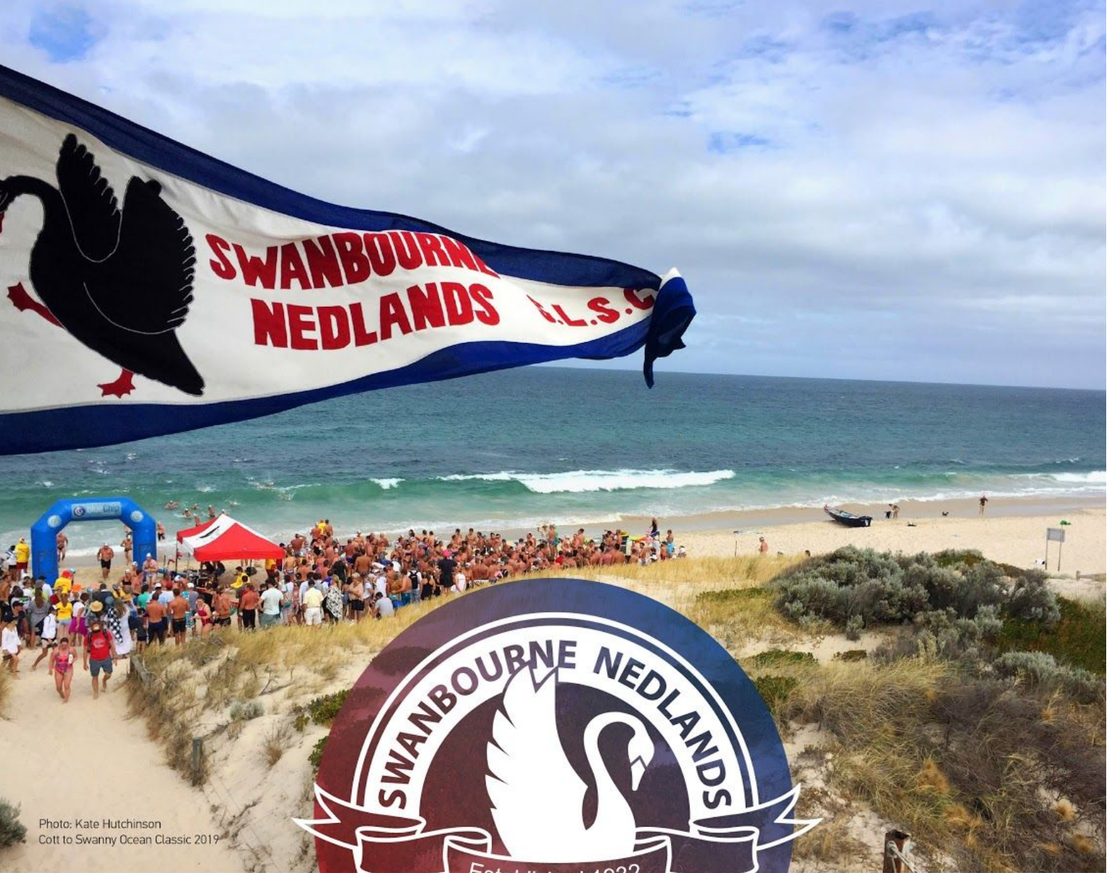
Cott to Swanny Ocean Classic 2019