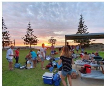
Post mega taplin relay BBQ