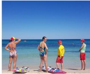
IRB's, boards and patrol Caps