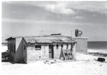
Old clubrooms near Swanny reef