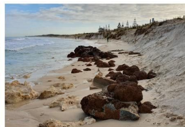
Swanny reef looking North. April 2019.

Plans for the expansion of the existing clubrooms have been simmering away in the background this season. We're coming up to an exciting time in the process where we will soon be able to share the draft plans with the wider membership. We are very much looking forward to being able to present this vision and hope to have some constructive community consultation. I hope everyone can get around the project over the coming seasons as we move into the development, fundraising and grant application endgame!