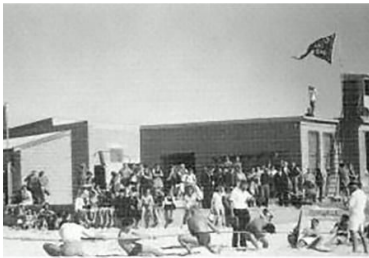
Clubrooms tug-of-war late 1940's

The club was a labour of love, built by members with mostly second-hand materials and hand-made concrete bricks. Without going into details, it reminded me of all the work that past members have contributed to get our club to where it is. Parallels can be drawn to the current club, supported mostly by members, using our own time, resources and know-how to overcome the issues of the day. Let's hope that ocean erosion isn't on the cards again for Swanny any time soon!