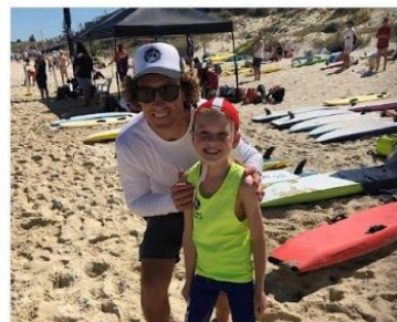
Nipper age group manager workshop