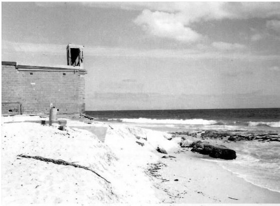
Old clubrooms on the brink. April 1960.