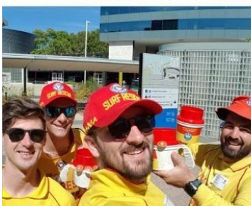
BeachSafe street appeal in the CBD