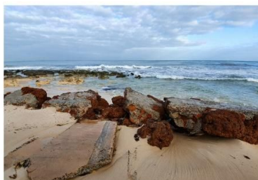
Swanny reef looking West. April 2019.