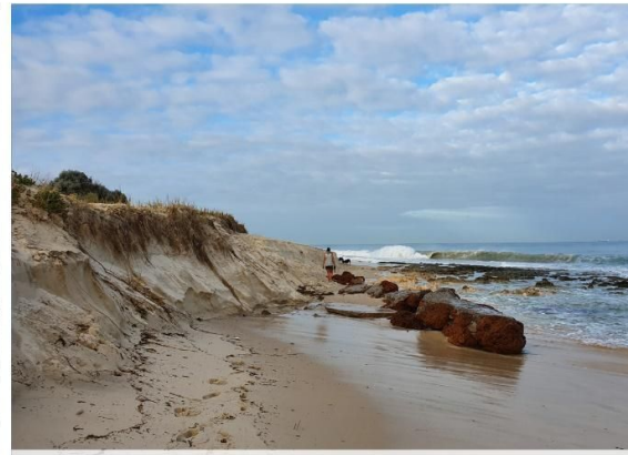
Old clubroom ruins re-surface. April 2019.