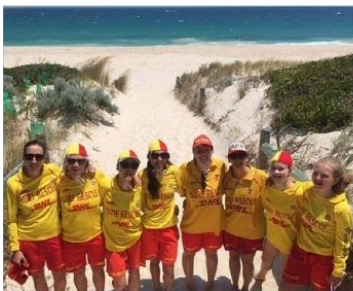
All female patrol - Swanny girls rule!