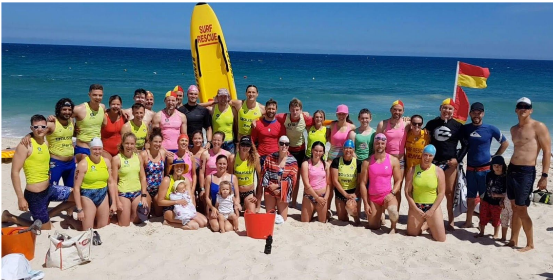
Mixed Board Rescue Race