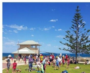
Junior Sundays at Swanny