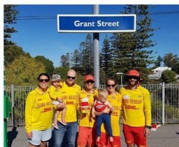
Street appeal at the train station