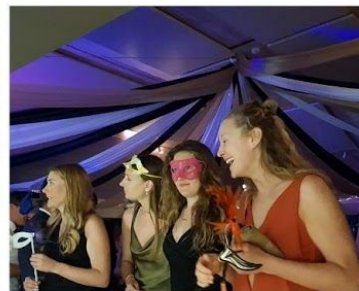
Presidents cocktail party