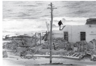
Dismantling old clubrooms near reef