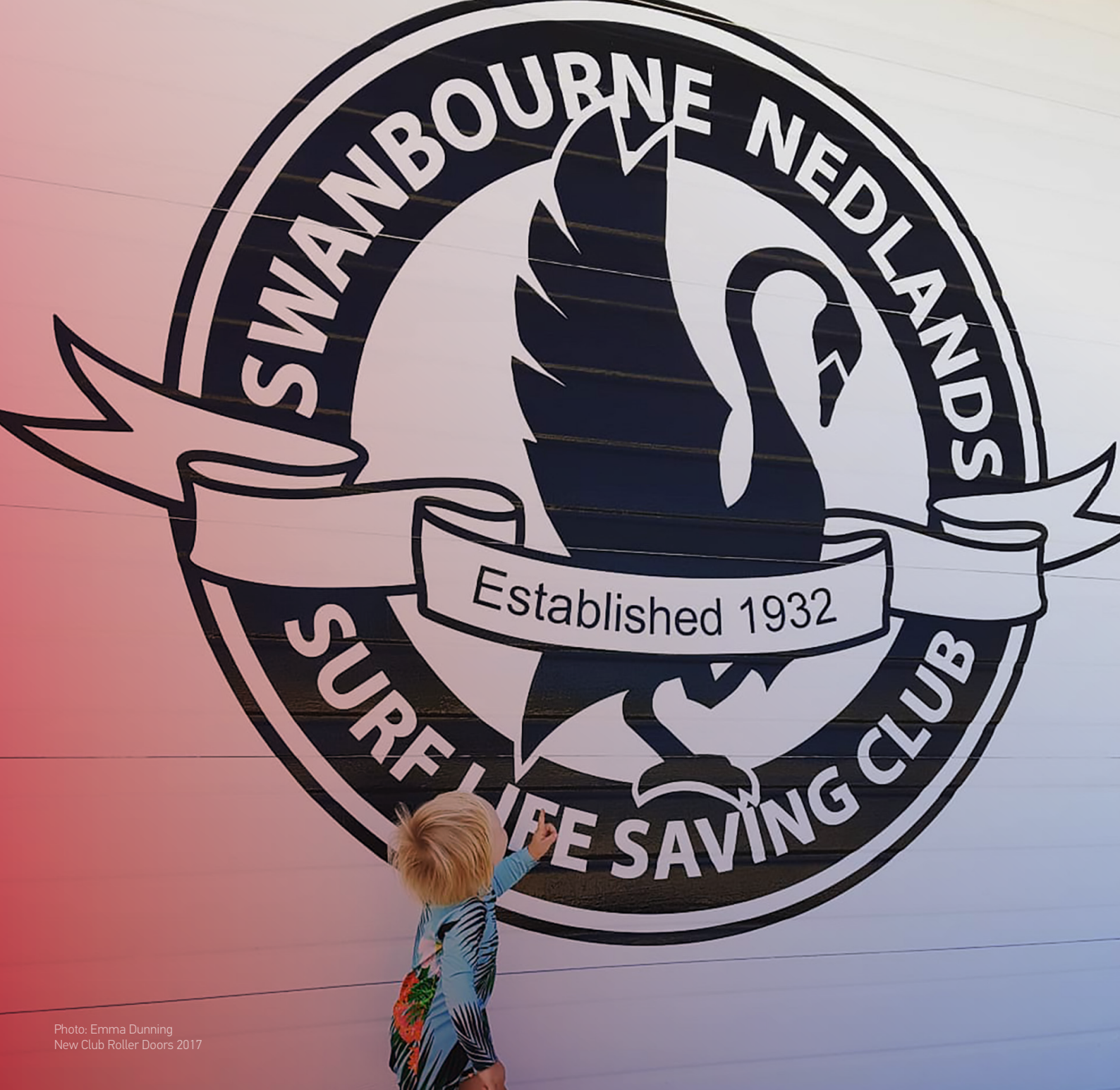
New Club Roller Doors 2017