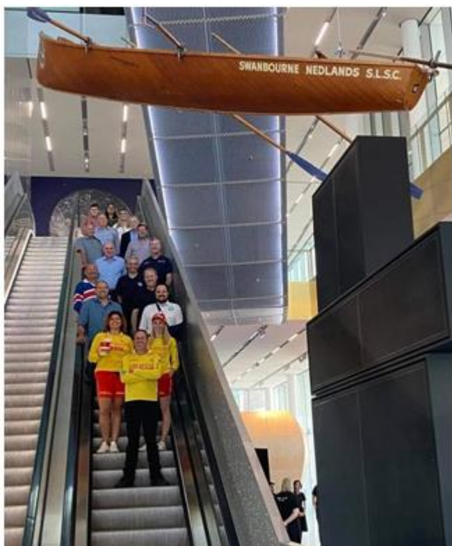
Cygnets V hanging in the new Perth Museum