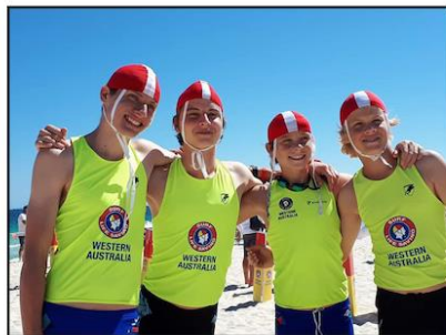
Junior members competing at States