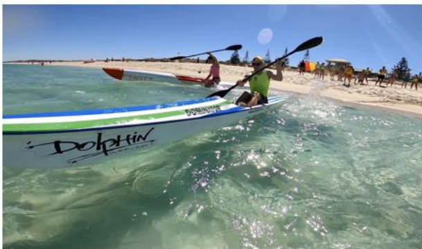
Nothing stokes the Swanny competitive fire like a fight for intra-club pride