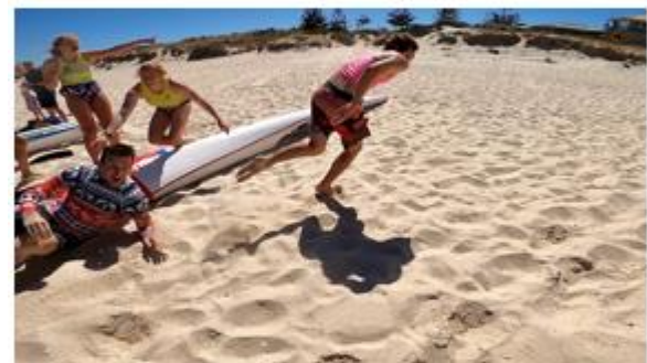
It ain't over until you cross the finish line