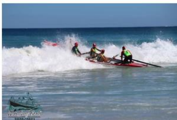
The Headless Oarsmen in action