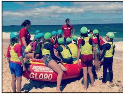
Learning about IRBs