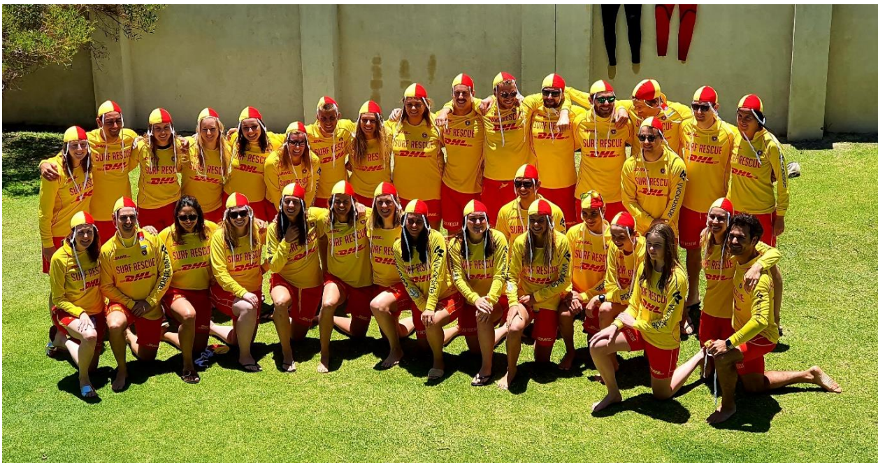
Swanny's successful Bronze Medallion participants

Given the late cancellation of our second bronze course last season due to COVID, the Bronze training started earlier this year, as refresher sessions and an assessment were organised to induct these members into our lifesaving patrols. Almost immediately after last year's group was finalised, the next crop of Swanny hopefuls were signed up and began to learn to navigate the Swanny shore dump and develop their lifesaving skills. This course was closely followed by our second Bronze course starting in early February, following a short hiatus for the festive season and school holidays. All up there were 80 new Bronze Medallion awards obtained this season- a massive achievement!