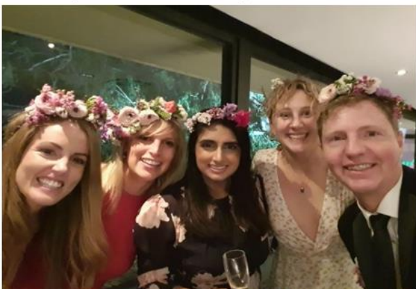
Floral revellers at Annual Dinner 2019-2020 's 'Secret Garden'