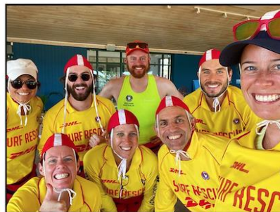
Swanny State Champion Patrol competitors