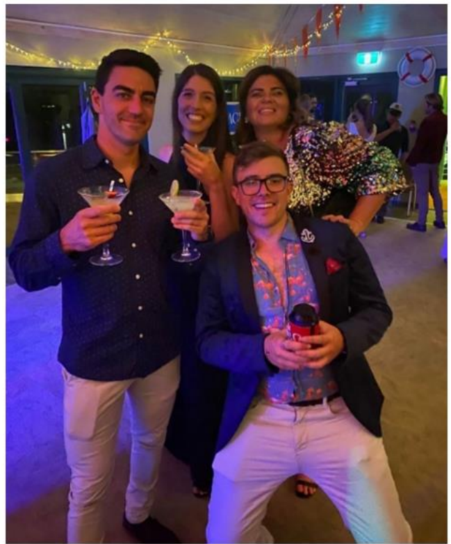
A few of her elegant passengers