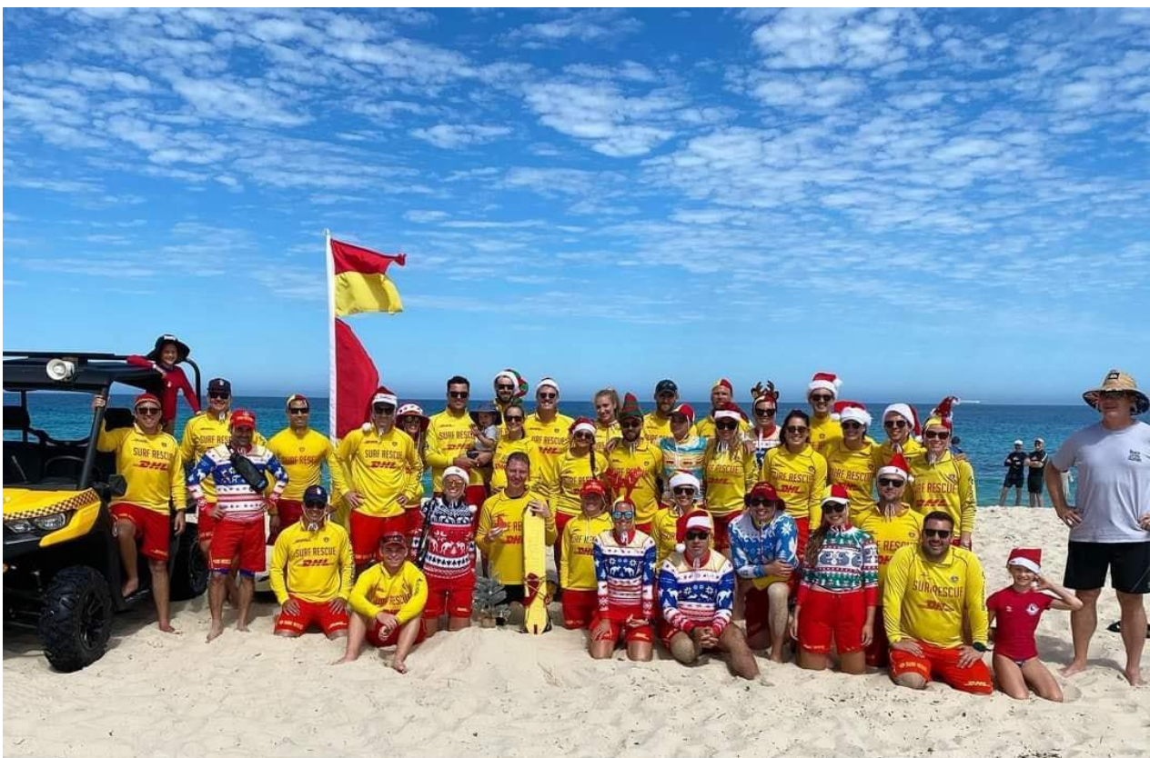
Swanny Christmas Day Patrol

The Christmas Patrol proved to be even more popular (potentially influenced by the promise of Swanny's first ever orphan lunch afterwards), with 38 members giving up their Christmas morning to keep an extremely busy beach safe! Between mouthfuls of delicious treats, the patrol was involved in the successful search for a missing four-year-old, who had a very happy but teary reunion with her grateful family after 15 frantic minutes.