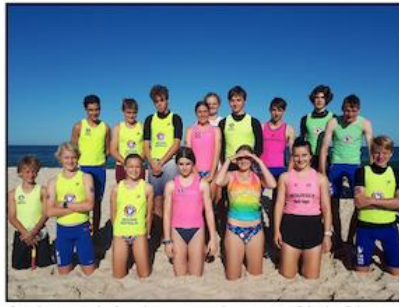
Cadet and Junior members at Club Championships