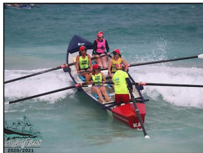
Our ladies boat crew competing