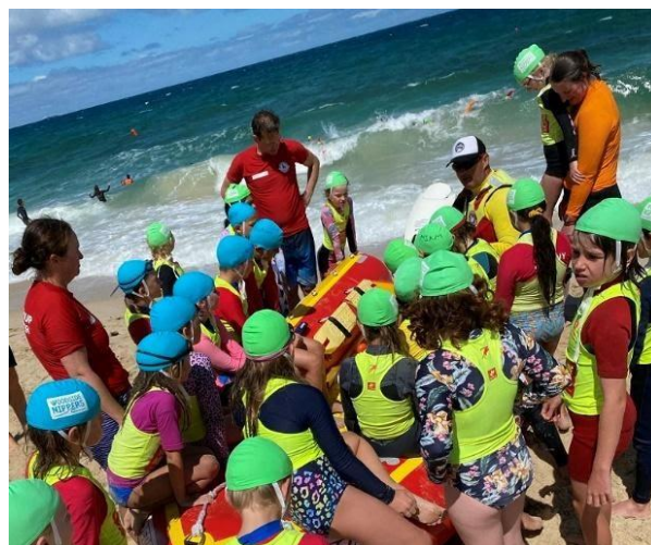
Swanny Nippers in action