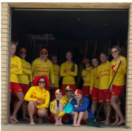
Swanny patrolling members