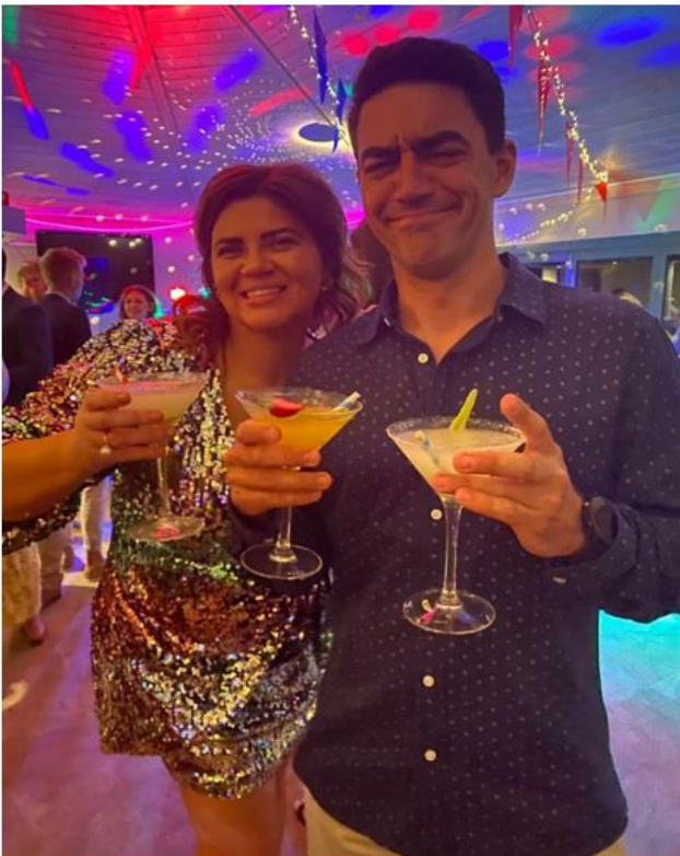
Staying hydrated with the ship's finest daiquiris

But no season is ever truly started until we dress up fine, drink cocktails and get messy. The President's Cocktail Party saw us board our maiden cruise for "Swan Voyage". The frozen daiquiris loosened us up for the D-floor and the Dark and Stormys made sure we all danced like we had no short-term memory. Thankfully we burned our life rafts and resisted a mutiny. What happens on the Swanny cruise, stays on the Swanny cruise.