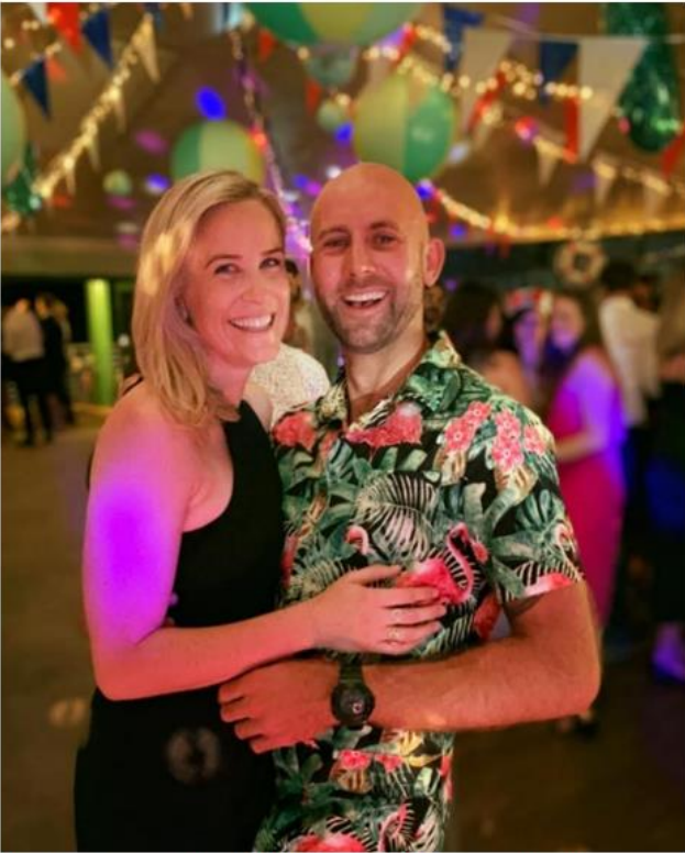
Captain Social & First Lady of the inaugural Swan Voyage