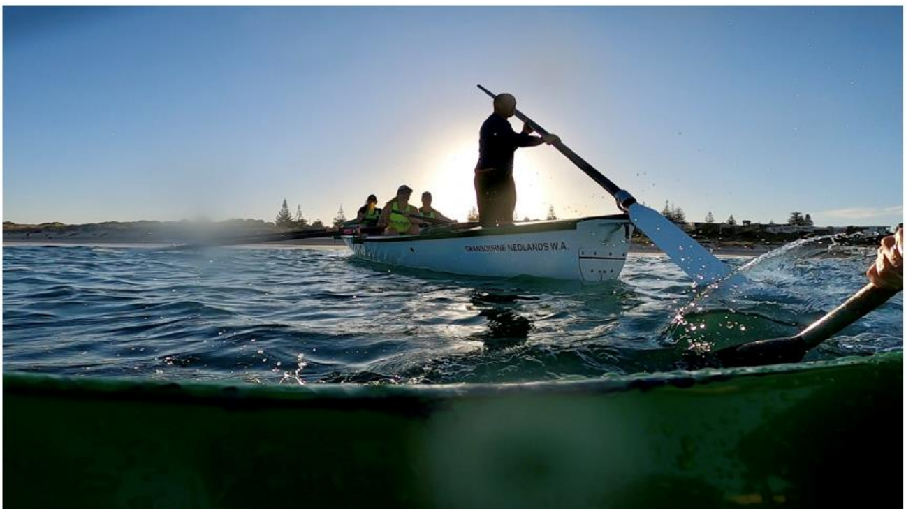
Early starts for our hard working Donkeys