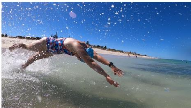
Swanny legends in action

The Management Committee is cognisant of our growing membership and the potentially unsustainable model currently being operated. We are in the early stages of discussing options to alleviate some of this pressure, including investigating the employment of more specialist help, the potential restructure of our Management Committee to a directorship, increased engagement and mentoring programs, or creating a natural vacuum. The solution is likely a combination of these, with an outlook to spread the load and lift engagement across the whole membership base.