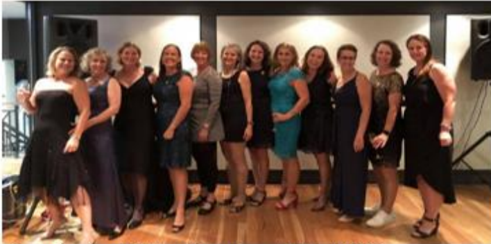
Some of our finest ladies of Swanbourne Nedlands SLSC