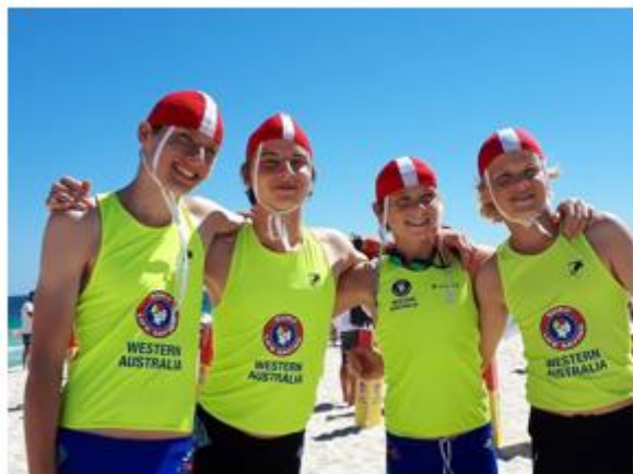
Swanny youth representing

It is also important to celebrate the achievements of our members who have shown tremendous dedication and trained extremely hard to improve their fitness and surf skills. Swanny had small but mighty teams at many of the carnivals and the first Surf League event. We also had some phenomenal swimmers cross the channel to Rottnest and our ski pirates took on long distance downwinder races.