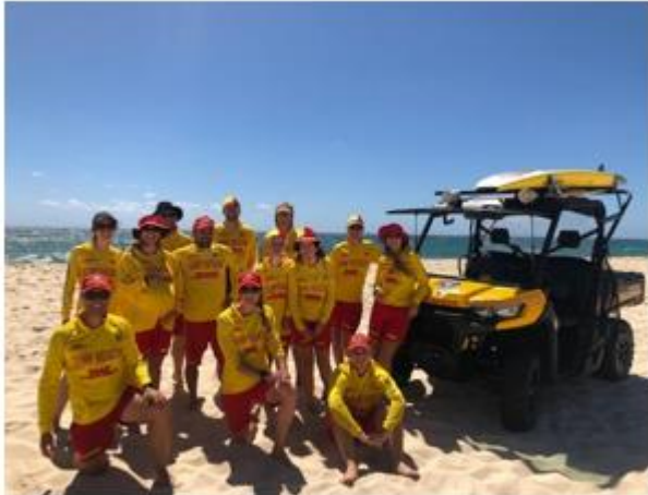
Swanny on patrol