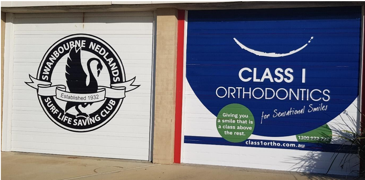
The Swanny boatshed repping signage for our major sponsor Class 1 Orthodontics

I would also like to thank our major Club sponsors; The City of Nedlands, Class 1 Orthodontics and The Shorehouse for their significant contribution to the Club this season. I am sure many of you noticed the Class1 Orthodontics sign on the garage door as you ordered your discounted coffee from NCFY.