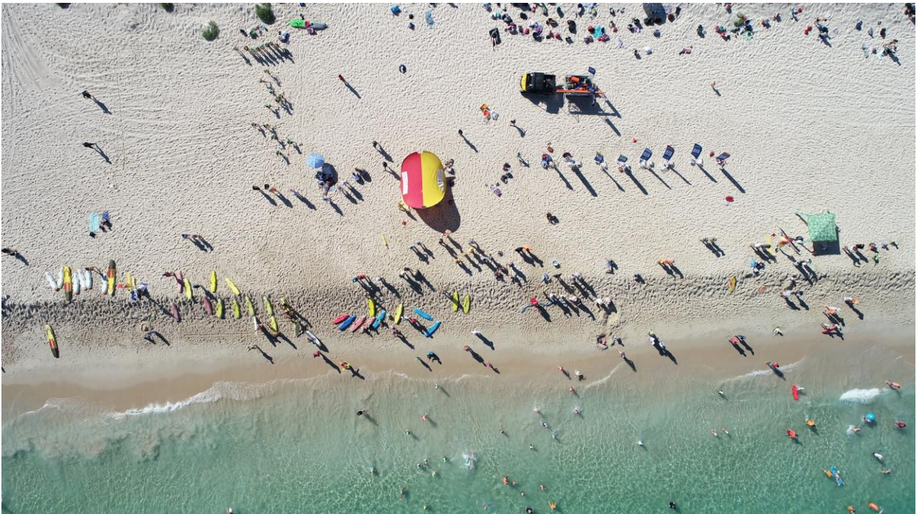
Sunday morning at Swanny Beach

*Statistics recorded are likely to be far lower than actual due to data lost using the SLSA Patrol Operations app