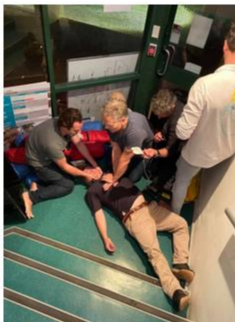
Swanny lifesavers training to save lives