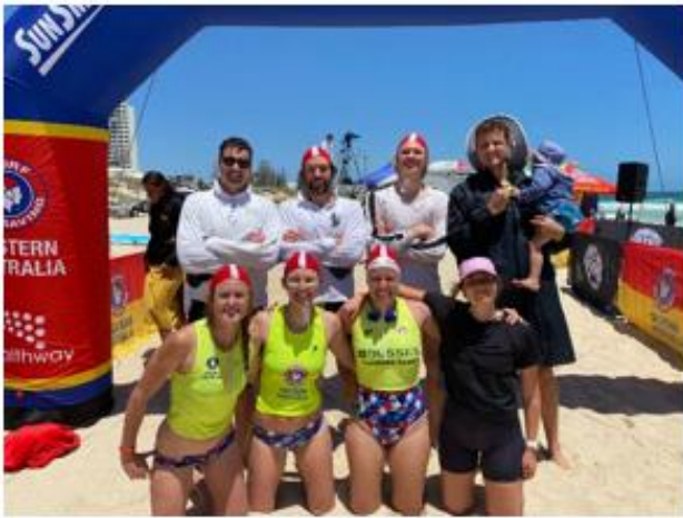
Swanny Surf League team, not last not lapped!