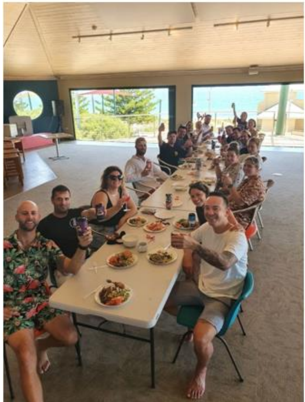
Pot luck Christmas lunch with the Swanny family

Thanks to all our amazing volunteers and the champions at Kook Brewing for donating a keg of beer, Swanny made just as much profit as the previous season, with 100 less people!