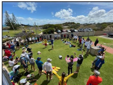
Nipper parents getting their NRC qualification