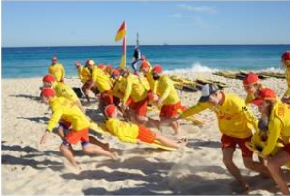
Spinal board drag race takes off