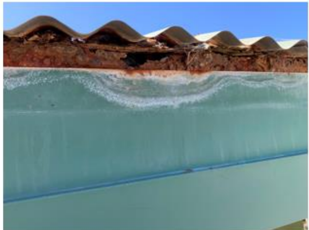
The Club is in need of serious repairs which will be done in conjunction with the building extension project

The other major variances in expenditure for the season are outlined below: