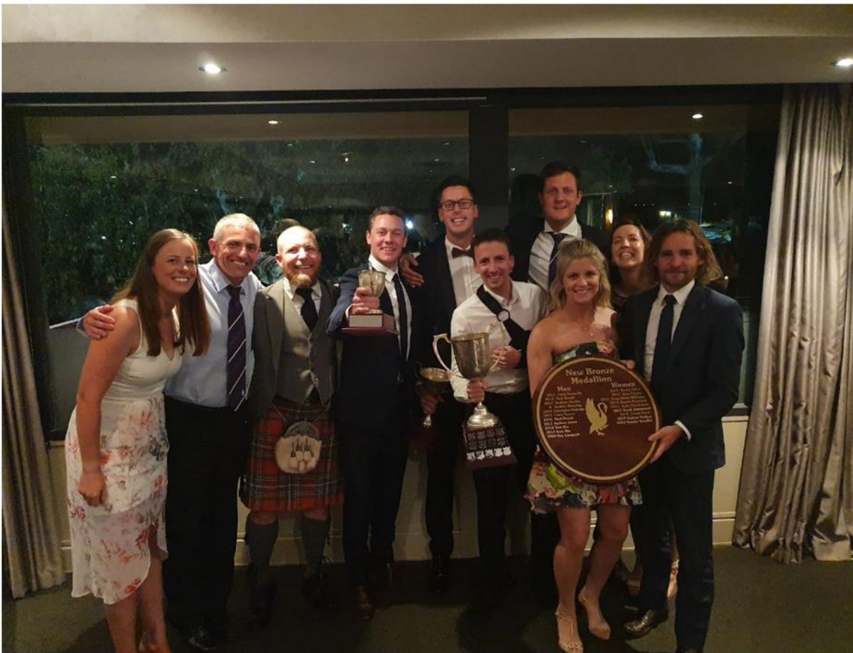
Award recipients at the COVID-19 delayed Annual Dinner 2019-2020, held in October 2020!