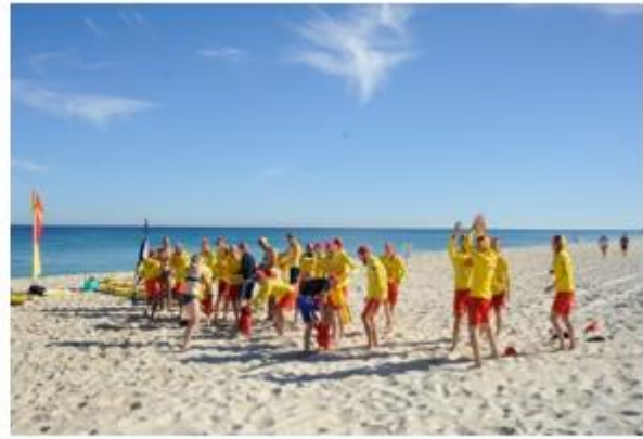
Strip/dress relay race in action