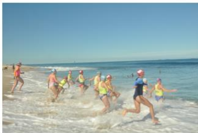
Women's Surf Race Club Champs