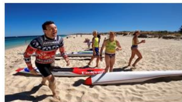
Beaten on the line by the Briggs!