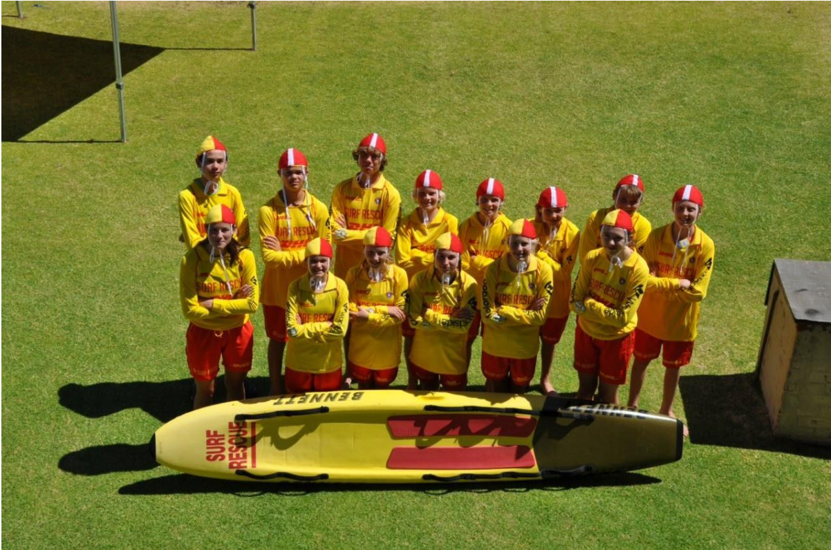
Swanna's latest SRC participants, Welcome to patrol!

Huge thanks to all the parents and senior club members who supported our Youth to achieve their life saving goals this year.