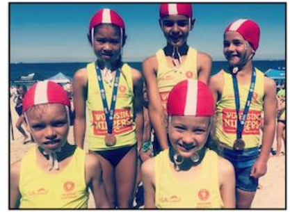
Little Nippers competing at States