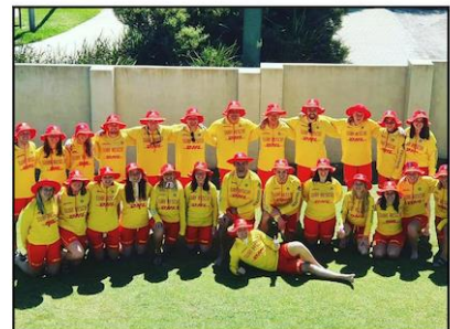
New Swanny Bronze Medallion members