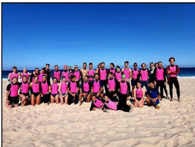
More new Bronze Medallion members