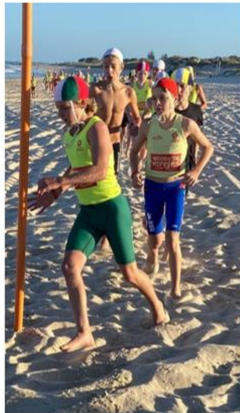
Swanny Nippers representing in the competition arena