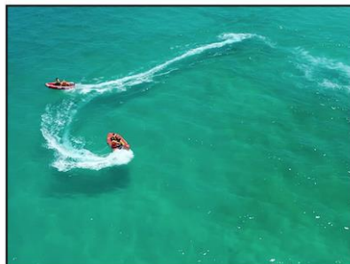
IRB Crew Course