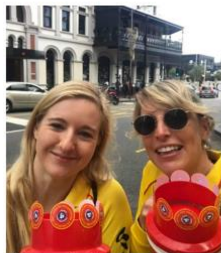
Shaking tins for Street Appeal

The Street Appeal was back in force this season and once again raised important funds for the club. Whilst not the money spinner it once was (coins – remember those?), it provided what is one of my highlights of the year, which was the opportunity to shake our tins at the new WA Museum and to get a lot of the old Swanny members together to see our old surfboat, the