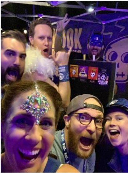
Blue Party 2021 - Take 2!